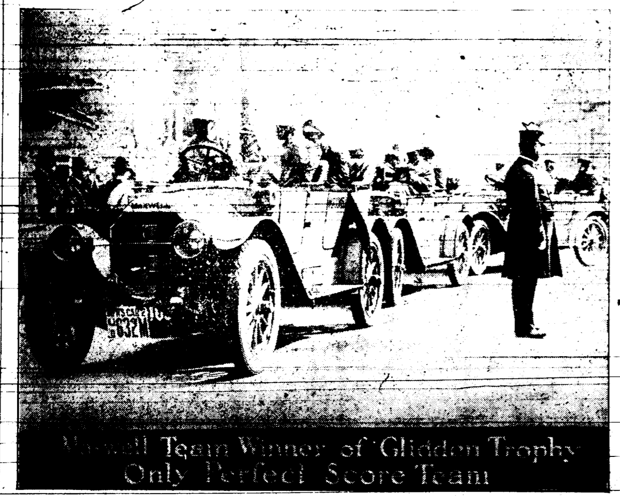
Team driver of Gladon Trophy Only Perfect Score Team